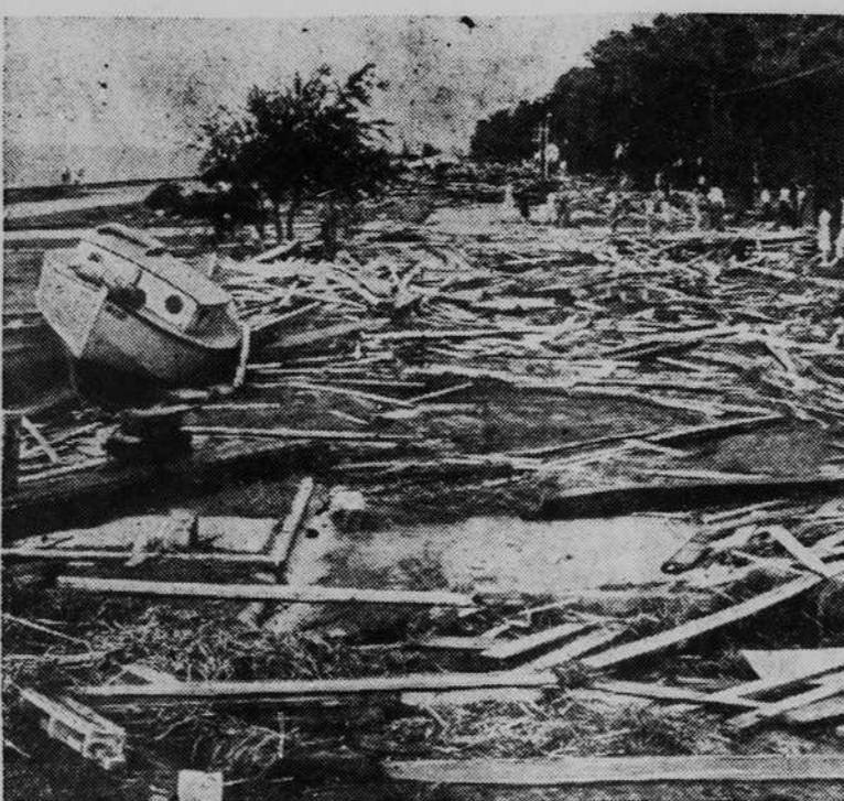
Emergency precautions were taken by towns along the coast of the two Carolinas yesterday to cope with a hurricane that was expected to move inland from the sea. The picture above shows damage done along the Florida coast by floodwaters surging relentlessly from the Everglades upon Miami.