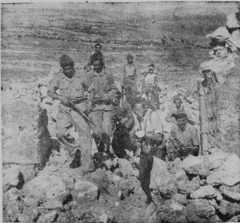
MEMBERS OF HAGANAH, the Jewish army, climb Mount Kastel over rubble of the destroyed town after forcing a large Arab force to withdraw. This important point overlooks the highway over which convoys must pass to Jerusalem, from which the Arabs are now making a desperate attempt to oust the Jewish troops.