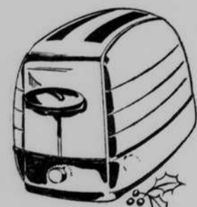
G. E., Universal and Electric Toasters. $21.50