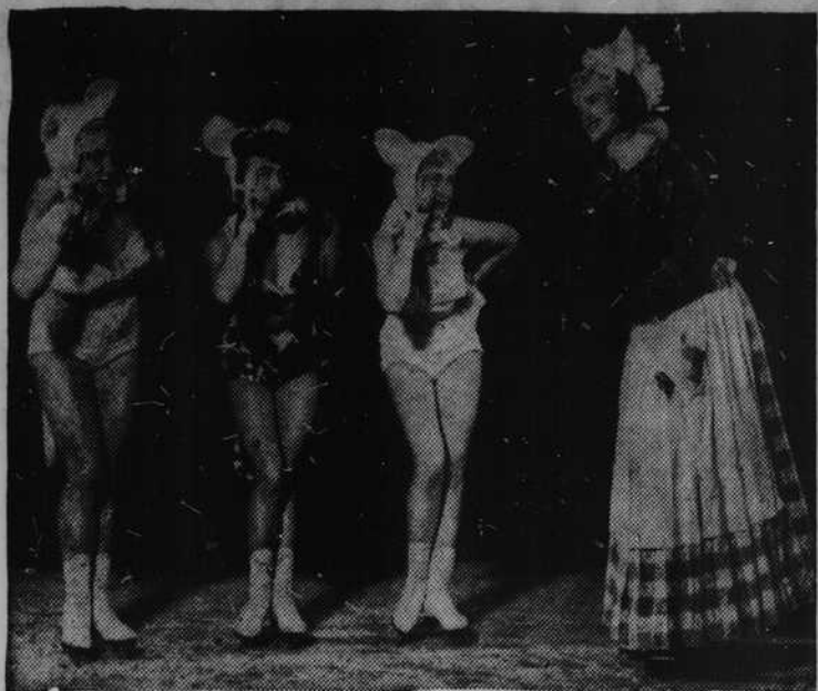
KUTE KITTIES: You've probably guessed it—they have lost their mittens and Mamma Kat is ready to reprimand them—one of the light-hearted numbers in the all new Ice Vogues of 1950 at Asheville's city auditorium starting Sunday, January 22.