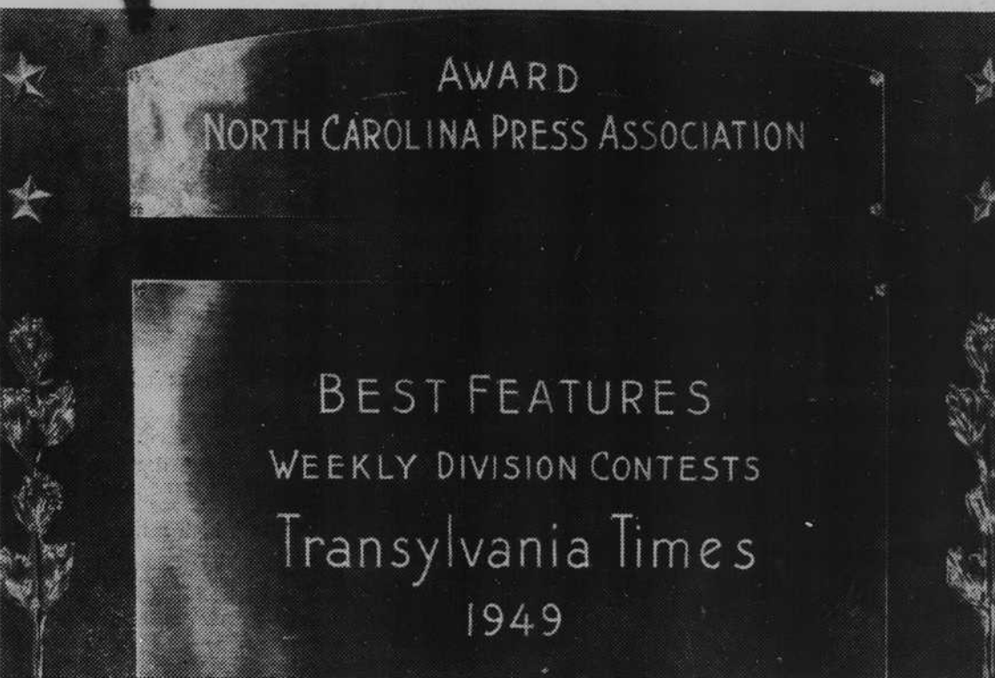
The Transylvania Times received three out of nine press awards for weekly newspapers at the banquet of the annual North Carolina Press institute last Friday night at Duke University. Directly above is shown the bronze plaque presented The Times for placing first in the best features division of the contest. Above left is the certificate for second place, best editorial page, and above right is another certificate won for third place, best news coverage.