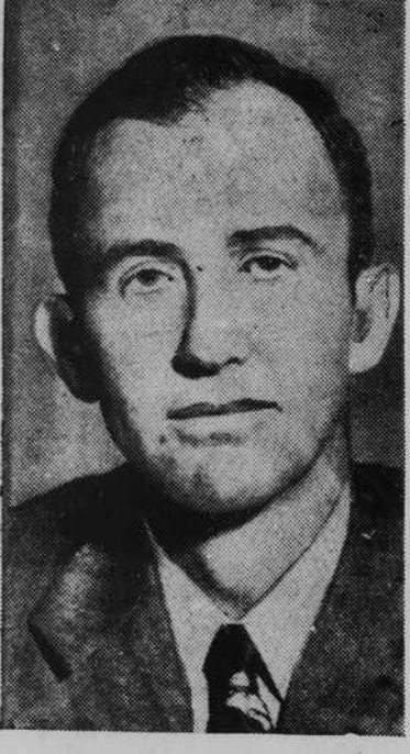
FRANK PACE, JR., director of the Federal budget, has been selected by President Truman to succeed Gordon Gray as secretary of the Army. Mr. Gray has accepted the presidency of the University of North Carolina.