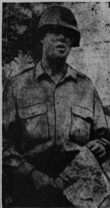
Commander of the 24th division, Maj. Gen. William F. Dean, has been unreported since the abandonment of Tacjon by U. S. Forces. Pictured in the city during the closing days of its defense, Gen. Dean was last seen passing ammunition to a bazooka team during the last-ditch fight to hold the city.