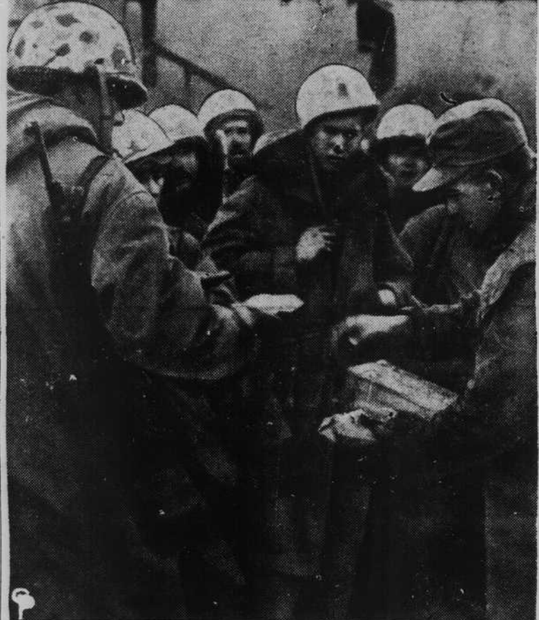
CHRISTMAS PACKAGES FROM HOME are handed to the Seventh Marines, whose drawn faces show the strain of fighting to escape a Red Chinese trap in northeast Korea. Best present for the tired Leathernecks was their safe arrival at Hungnam's evacuation beaches.