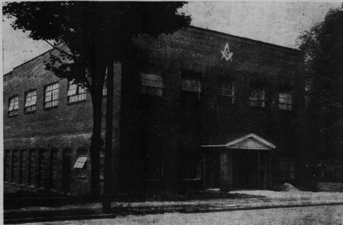
Construction is being completed on the new Masonic temple here on East Main street and the initial official meeting in the building will be the annual 38th district conference next Tuesday night. A capacity crowd is expected to represent the four lodges at the afternoon and evening sessions, and all local Masons are urged to be on hand to welcome the delegates to Brevard. When the new temple is completed, it will be valued at approximately $75,000 and will be a decided asset to the community, (Times Staff Photo).