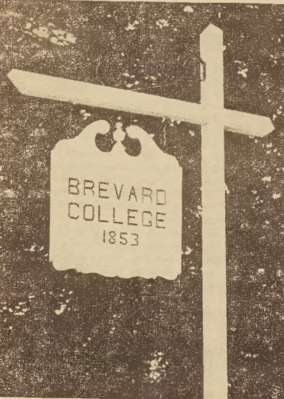
With the opening of the 1953-'54 term, Brevard college begins its second century in the field of Christian education. A special student-faculty workshop is slated at Camp Tekoa between Brevard and Hendersonville from August 31 to Sept. 3, when Freshman week begins. Registration will be held on September 7th, and classes begin on the following day.