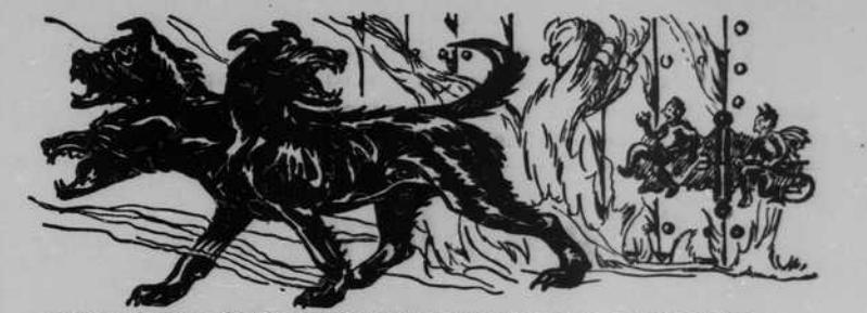
IN MYTHOLOGY, CERBERUS, A THREE-HEADED DOG, GUARDS THE ENTRANCE TO HADES