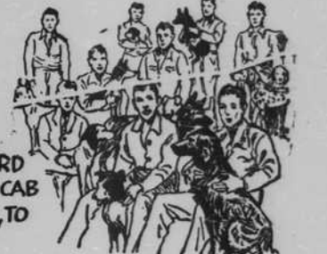
ELEVEN DOGS OWNED BY FRATERNITIES AT RENSSELAER POLYTECHNIC INSTITUTE SPEND THE SUMMER VACATION AT HOMES OF STUDENTS