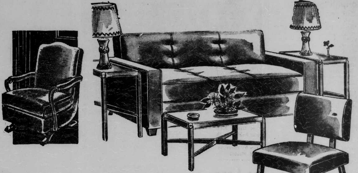
FIGURE FOR YOURSELF HOW MUCH YOU SAVE ON THIS SENSATIONAL 10-Piece Living Room Group