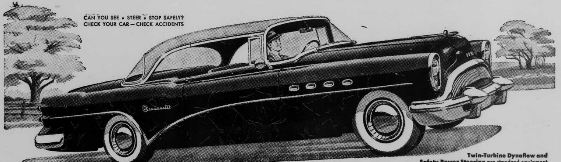
CAN YOU SEE • STEER • STOP SAFELY? CHECK YOUR CAR—CHECK ACCIDENTS

It costs you nothing to do so—and it can open your eyes to the finest buy in fine cars today. Drop in, or call us this week: