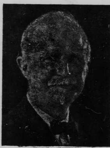
ROGER W. BABSON, rated as the most outstanding economic analyst of the nation, gives his business and financial outlook for the second six months of 1954 on pages four and five in the first section of this week's issue of The Times. Mr. Babson's score for last year was 84 per cent accurate. —Turn To Page Seven

Publisher Of The Times Has Been Active In Nationwide Organization Since 1942