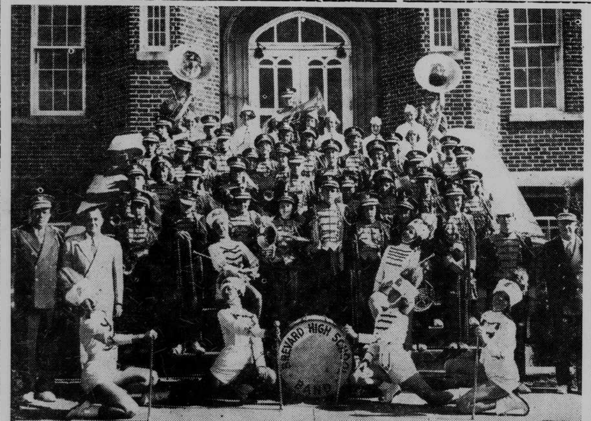
THE BREVARD HIGH SCHOOL BAND , recognized as one of the finest in the Western Carolinas, will make its first two appearances of the 1954-'55 season on Thursday. At 2:30 o'clock the band will lead a parade through Brevard, and that evening the group will play at the Brevard-Biltmore game here.

Members are aiding as solicitors and will make contacts by calling on business and professional people. —Turn to Page Four