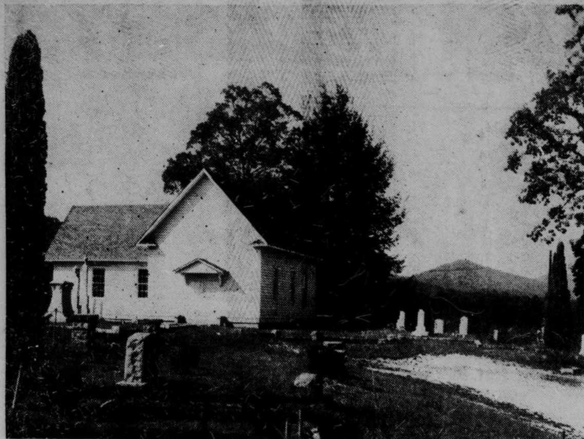
OAK GROVE METHODIST church, the oldest in Transylvania county, will observe the 107th anniversary at the homecoming this Sunday. The church and a portion of the cemetery adjoining is shown above. Many of the county's pioneers and their descendants are