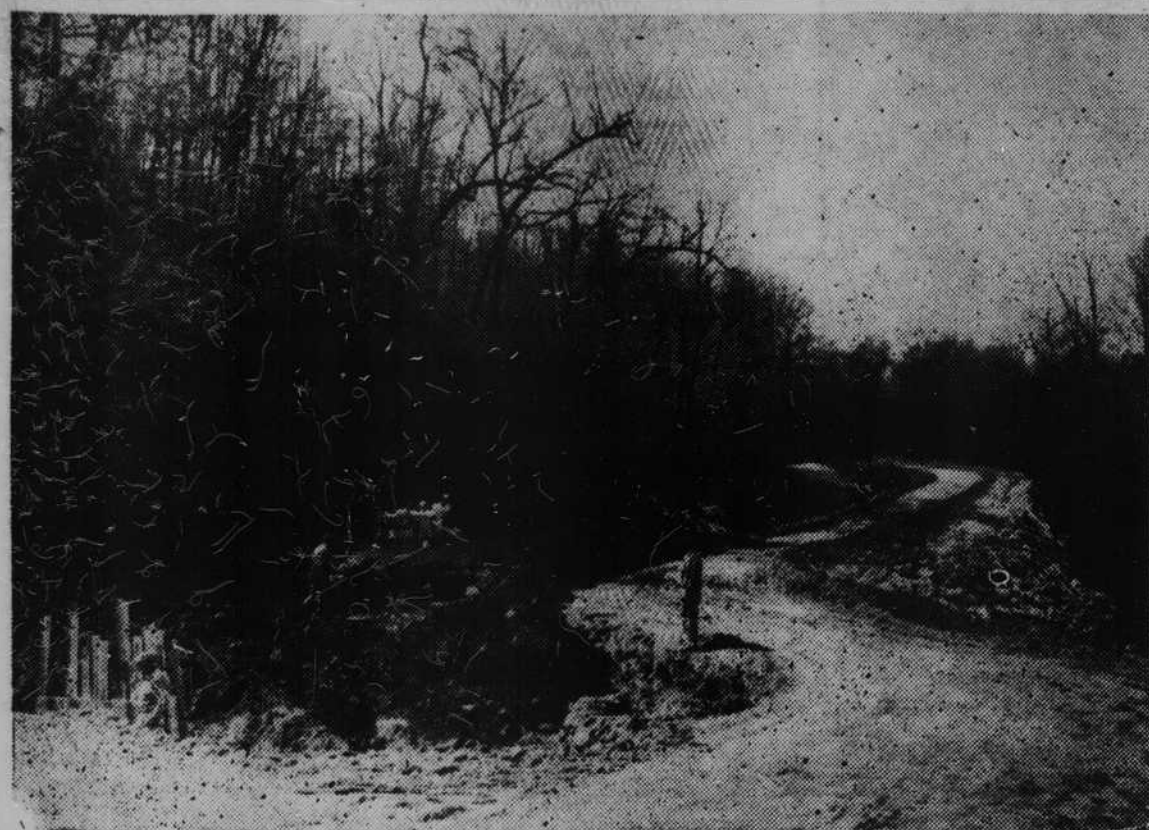
THE LAKE TOXAWAY ROAD , which is Highway 281, is now being graded and improved, and workmen can be noted above widening the intersection with Highway 64. Stone is also being applied over the route, and blacktopping is scheduled later this spring or in early summer. Charlie McCrary is the contractor on the job.

Vol. 66, No. 18 ★ SECTION ONE ★ BREVARD, NORTH CAROLINA, THURSDAY MAY 5, 1955 ★ 18 PAGES TODAY ★ PUBLISHED WEEKLY