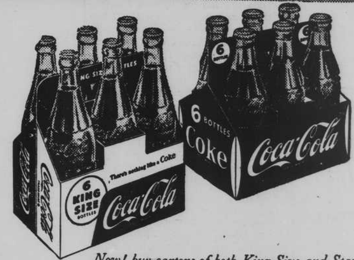
Now! buy cartons of both King-Size and Standard-Size

Fifty million times a day... at home, at work or on the way "There's nothing like a Coke!"