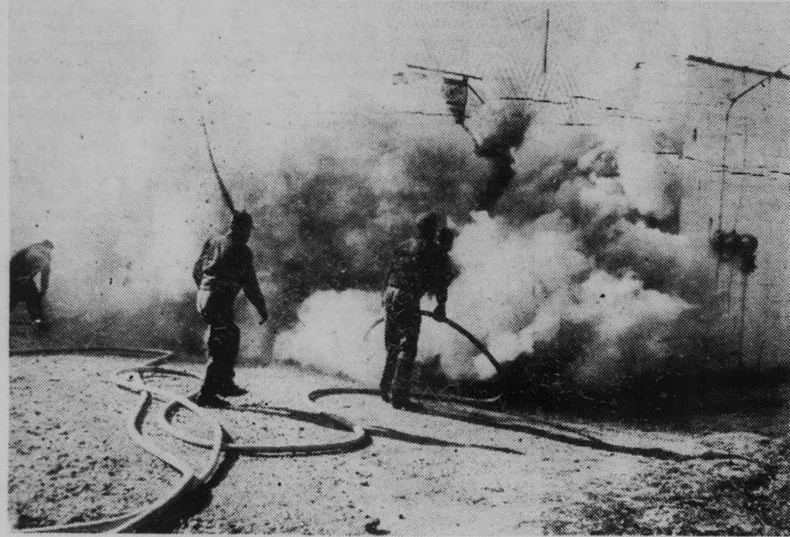
WHEN THE BREVARD FIREMEN answered an alarm last week at the City Limits grocery on the Rosman highway, they were greeted with a terrifically hot blaze and a store full of smoke. Two lines were laid from a nearby creek, and the local fire-fighters were able to save the building, but the stock and fixtures were a total loss. However, the adjacent living quarters and furnishings were saved.