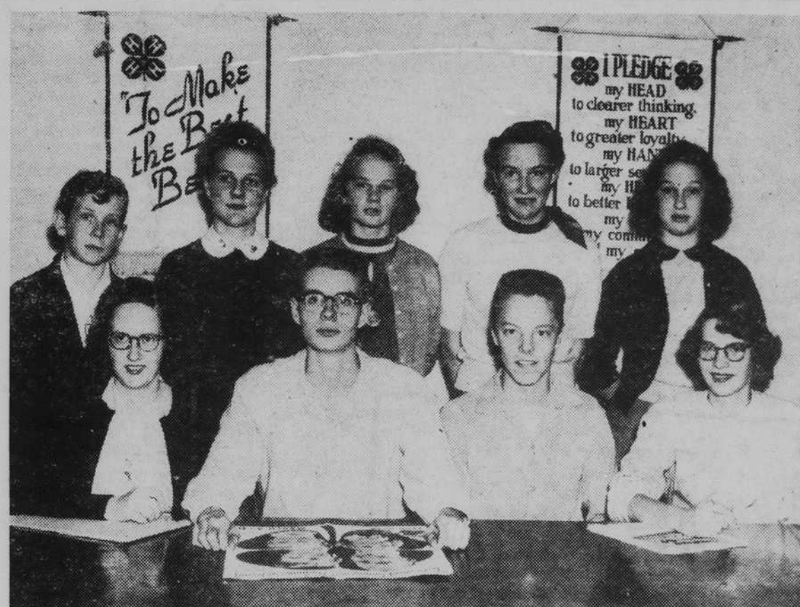
THE TRANSYLVANIA 4-H COUNCIL is busy this week making plans for the annual observance of 4-H week from March 3rd to 11th, and the members are pictured above in the county agent's office. Total enrollment in Transylvania is 649 boys and girls in the four community clubs and the 12 4-H clubs in the schools. The theme of the observance this year is "Improving Family and Community Living", and programs will be carried into