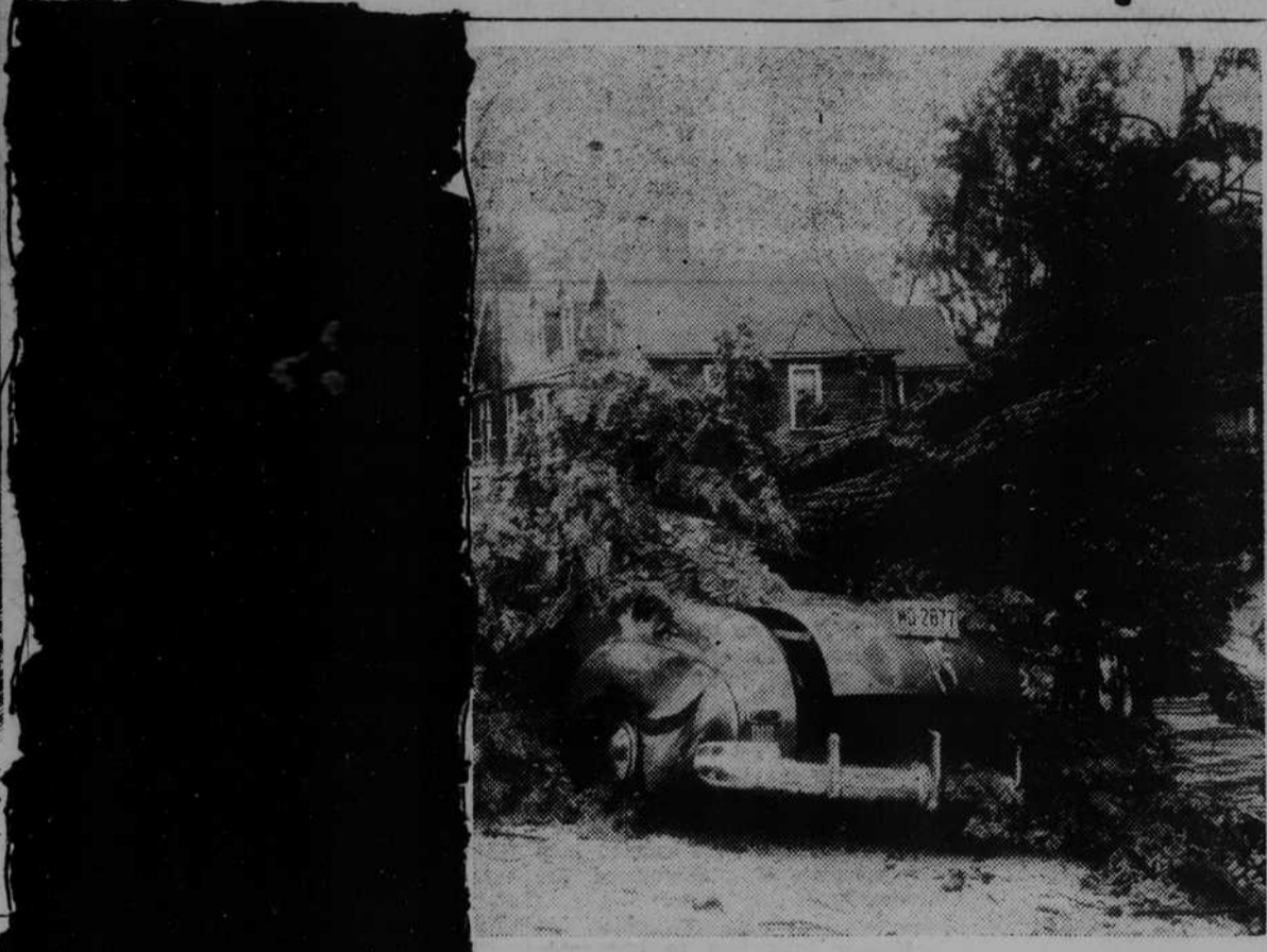
AN AUTOMOBILE, parked next to the Sinclair service station on East Main street, was practically demolished by a fallen tree during last Friday afternoon's wind and rain storm here. The car belonged to C. R. McNeely, and power and telephone lines were also knocked down, when the tree was uprooted.