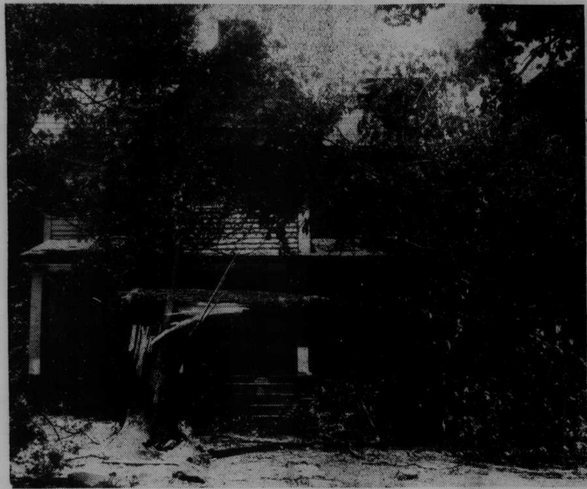
ONE OF THE MANY huge trees uprooted in the town of Brevard by the high winds last Friday afternoon is pictured above. Fortunately, the tree was blown to the side of the house at 206 Probart,

and damages to the residence were kept at a minimum. However, many other homes and buildings were badly damaged by fallen trees and limbs.