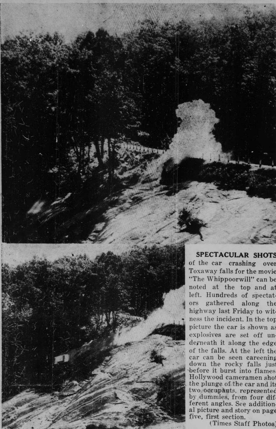
SPECTACULAR SHOTS of the car crashing over Toxaway falls for the movie "The Whippoorwill" can be noted at the top and at left. Hundreds of spectators gathered along the highway last Friday to witness the incident. In the top picture the car is shown as explosives are set off underneath it along the edge of the falls. At the left the car can be seen careening down the rocky falls just before it bursts into flames. Hollywood cameramen shot the plunge of the car and its two occupants, represented by dummies, from four different angles. See additional picture and story on page five, first section.