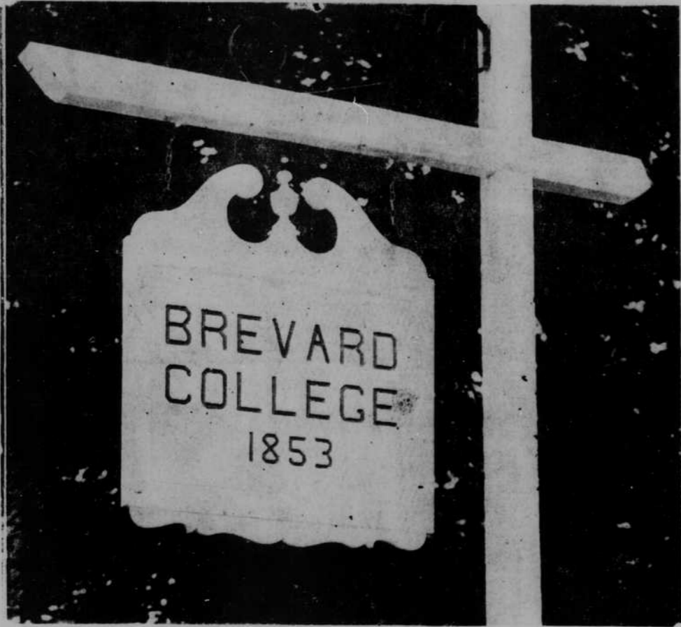
THE BEAUTIFUL CAMPUS OF BREVARD COLLEGE is a busy place with the opening of the 105th year at the local educational and religious institution. A

large student body is enrolled, and facilities for teaching and housing the students have been vastly improved.