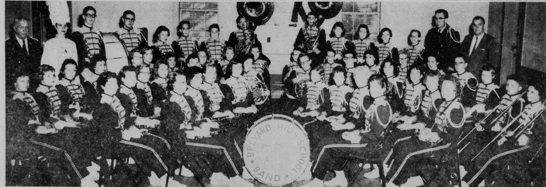
THE FINE BREVARD HIGH SCHOOL band will lead the gala Christmas parade in Brevard next Tuesday afternoon, when the 1958 Christmas shopping season will officially open and Ole Santa will come to town. The parade will form at 4:30 o'clock

You are also urged to take advantage of the many gift values advertised in this issue.