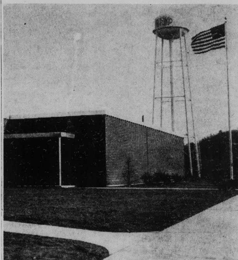
EXPANSION OF THE DU PONT silicon plant in Buck Forest is announced today. The picture above shows the front of the modern plant with the American flag and the water tank in the background. Another photograph, an overall view of the Du Pont plant, is carried on page three, first section, in this week's Times.

WORLD'S LARGEST OF ITS KIND, IS CHEROKEE ARROW