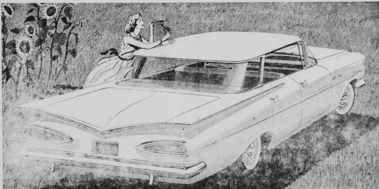
A new addition to Chevy's line—the beautiful Bel Air 4-Door Sport Sedan.

now—see the wider selection of models at your local authorized Chevrolet dealer's!