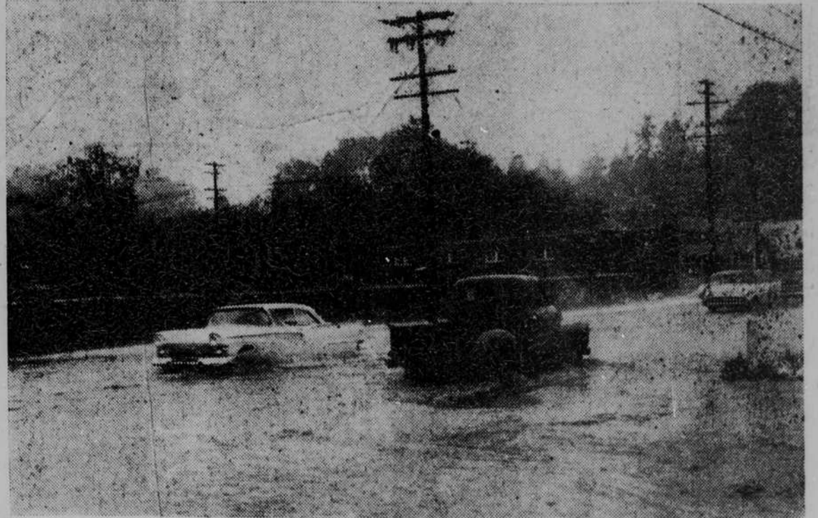
HAIL AND HIGH WATER hit Brevard and Transylvania last Wednesday afternoon. At the left is a "January in June" shot which was taken in front of B & B Feed and Seed company on Gaston street. This picture was sent out by AP wirephoto and was used in many