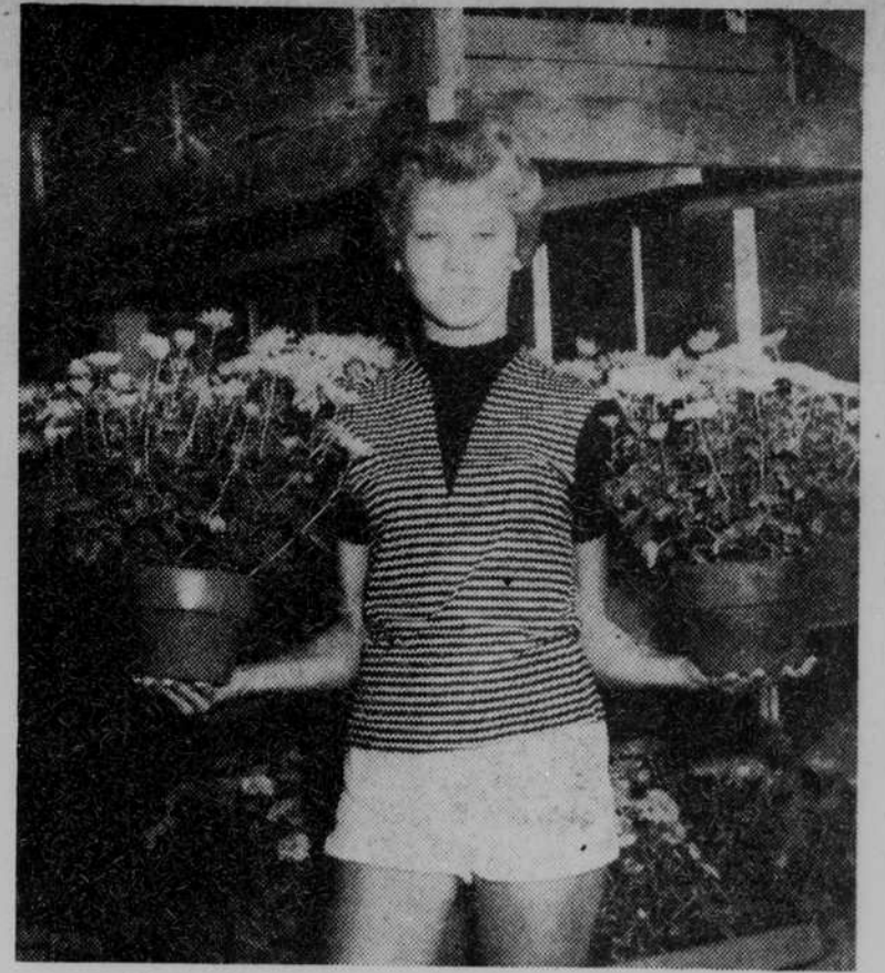
is visiting here. She is holding two of the 14 different varieties that are grown locally. At the Ft. Myers farm, some 72 varieties are produced on the 22-acre "Pom-Pom" farm. Plans call for expanding the local operation next year.

TRANSYLVANIA— The Land of Waterfalls. Mecca for Summer Camps. Entrance to Pisgah National Forest and Home of Brevard Music Festival.