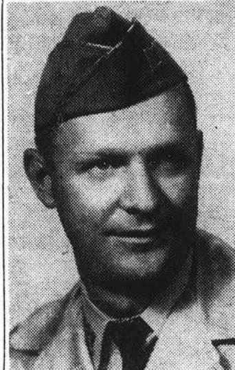
didate Advisory service of the Air Force academy in this area.