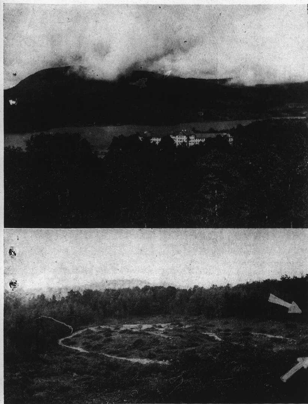
SOME 50 YEARS separate the dates when the two photographs above were made. The upper picture was made around 1910, when Lake Toxaway and Toxaway Dam were in their "heyday" as a paradise mountain retreat. The lower shot was made on Monday of this week, and the arrows point to the site where the dam will be constructed in the immediate future. The beginning of the clearing of the lake bed can also be noted.