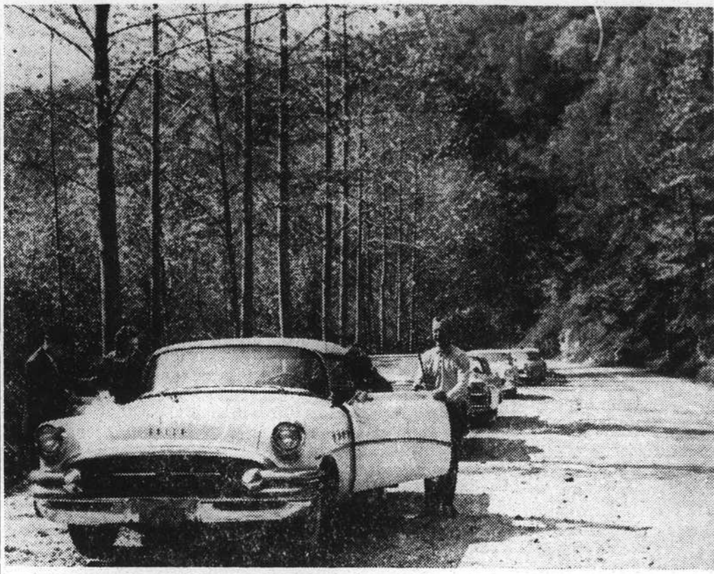
THOUSANDS AND THOUSANDS of visitors from all sections of North Carolina and many other states flocked to the Pisgah National Forest last weekend to see nature's parade of colors. A repeat performance is expected this week, when the color should be at its height.

Wednesday, November 2 — Toastmasters meet at Gaither's at 6:30 p.m. WOW meets in Woodman Hall at 8:00 p.m.