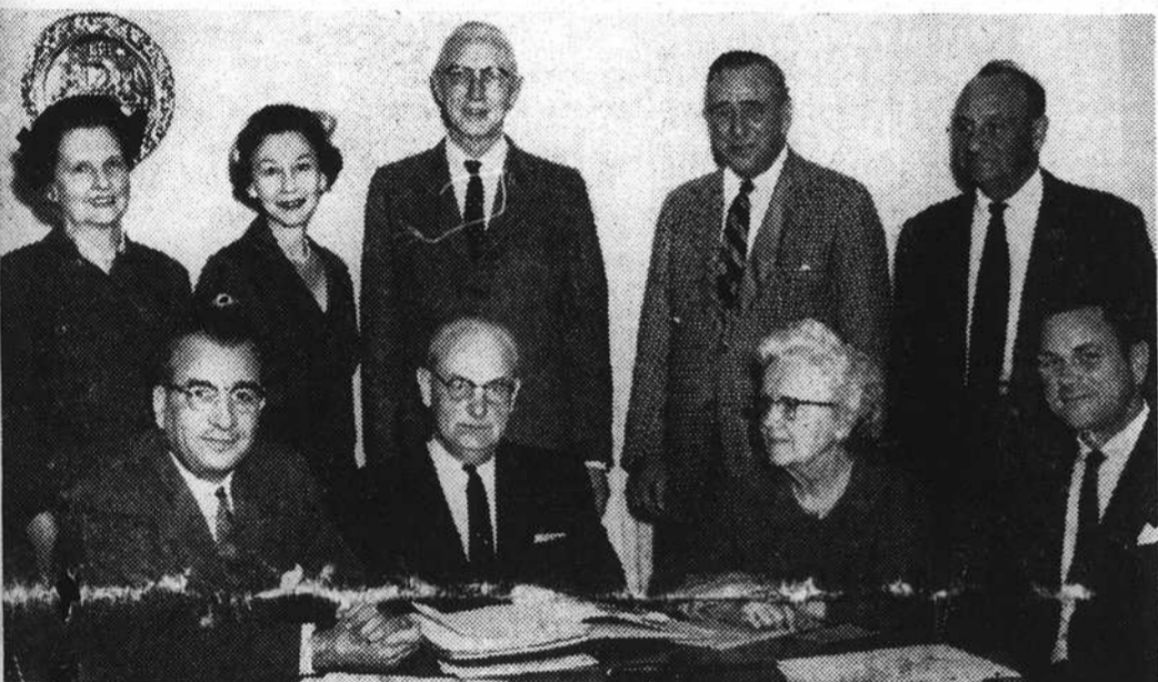
EXECUTIVE BOARD MEMBERS of the Brevard Music Foundation held its annual fall meeting here at the Colonial Inn last Saturday morning, and discussed plans for the celebration of the 25th anniversary of the Transylvania Music Camp next summer. It was also reported that the past season had been one of the best in the history of the Brevard Music

Vol. 71 — No. 44 SECOND CLASS MAIL PRIVILEGES BREVARD, N. C., THURSDAY, NOVEMBER 3, 1960 ★ 20 PAGES TODAY ★ PRICE 7c PUBLISHED WEEKLY