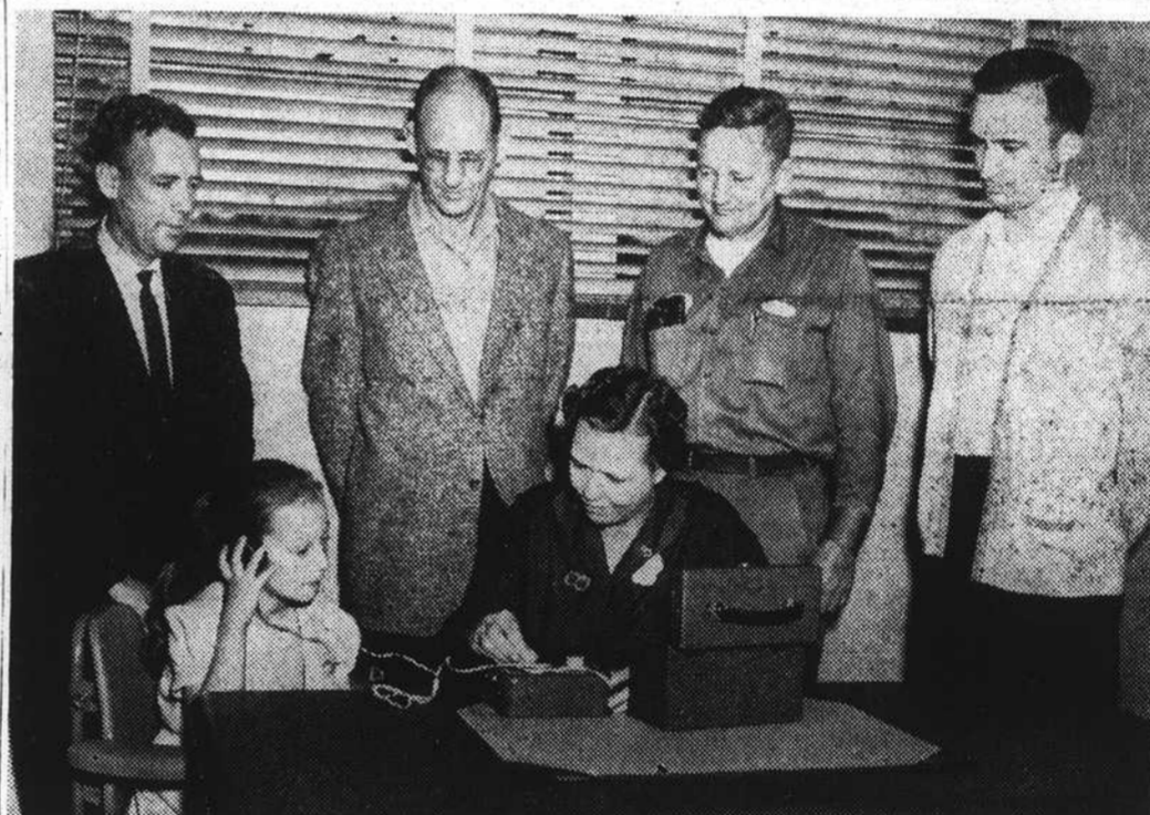
THE BREVARD KIWANIS CLUB has donated an odometer to the Transylvania Health department, which will be used in all the schools of the county. This electronic device is used to determine defective hearing, and the bright young lady above