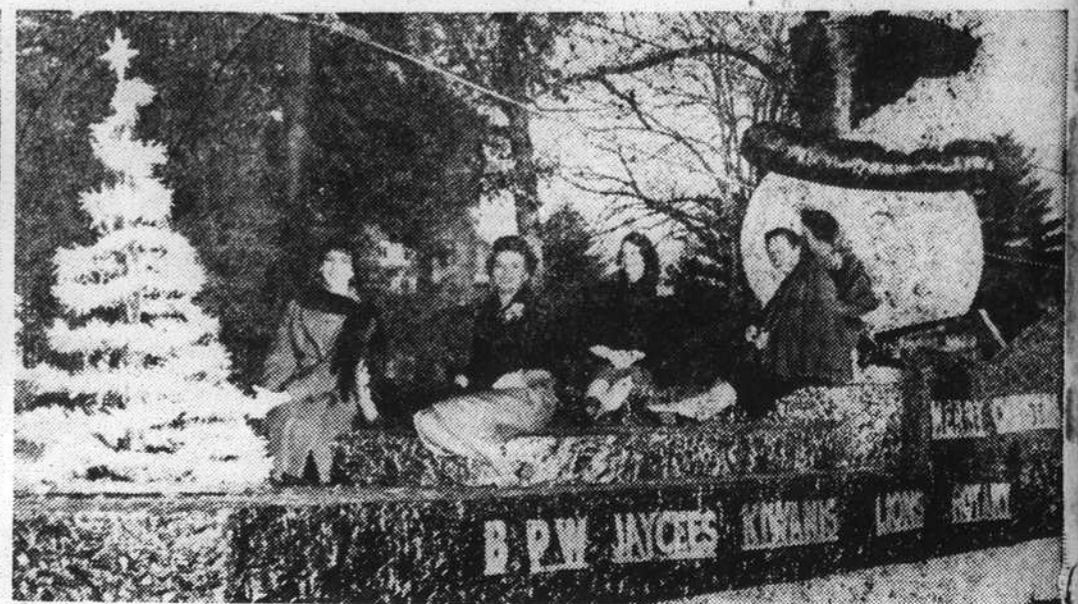
the BPW, Jaycees, Kiwanis, Lions, and Rotarians.

TRANSYLVANIA— An Industrial, Tourist, Educational, Agricultural and Music Center. Population, 1960 Census, 16,102. Brevard Community 8,500.