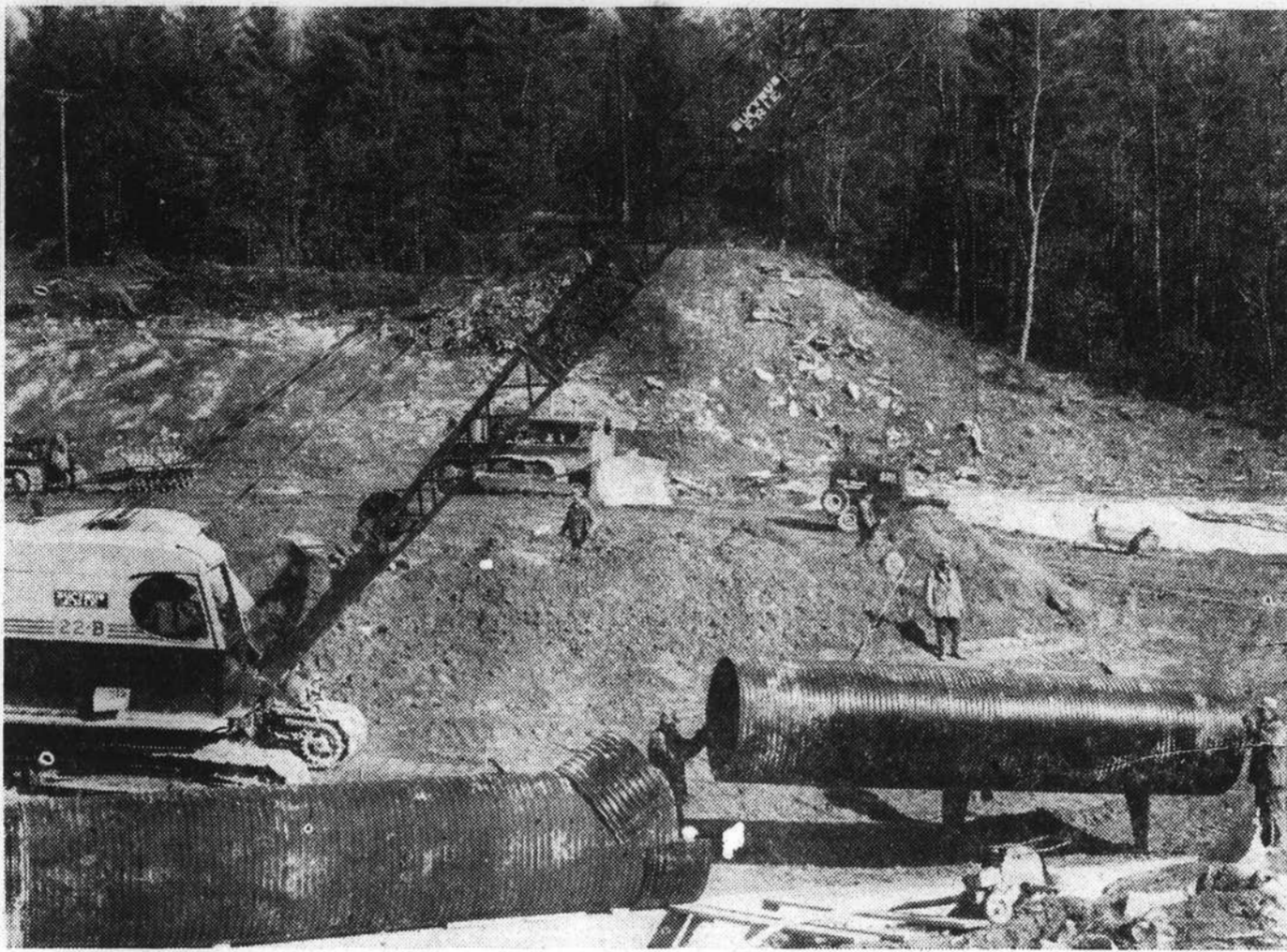
A SECTION of 48-inch corrugated metal pipe is placed in its concrete cradle as construction advances on a dam for new Lake Toxaway in our North Carolina Blue Ridge Mountains. This pipe