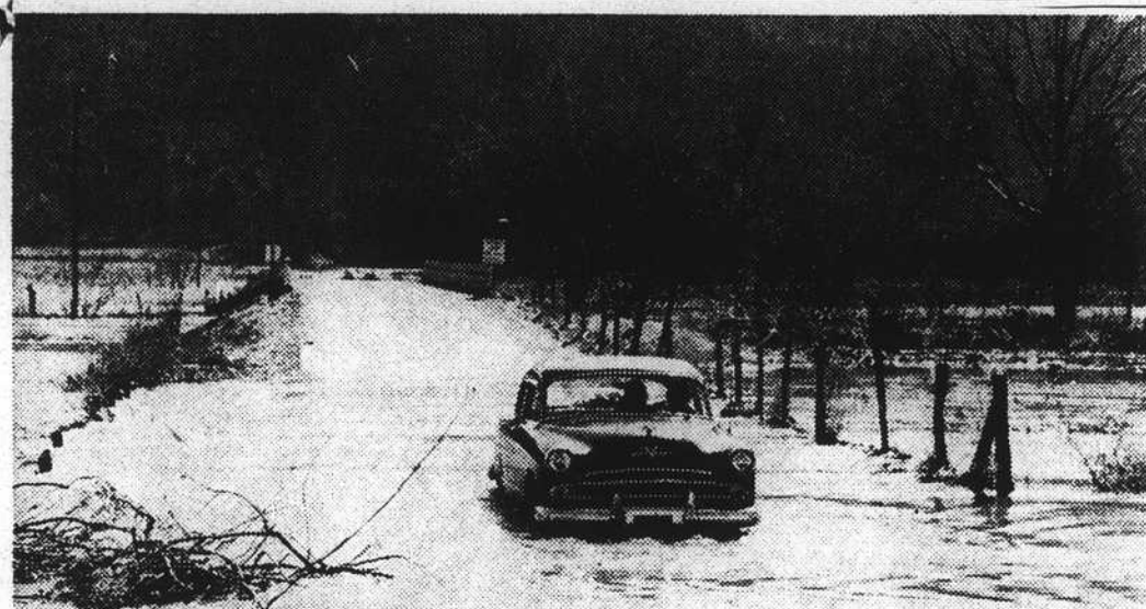
HIGH WATERS in lower Transylvania caused many automobiles to stall last Saturday night and Sunday. One of the unfortunate victims is pic-