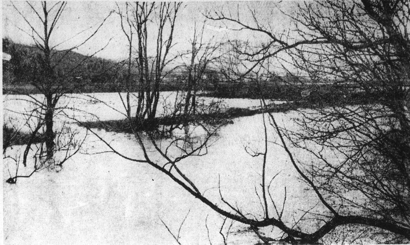
opposite Sapphire Manor. Wedged as they were, the planes suffered only minor damages and gave the Times Staff photographer "the shot of the year". The heavy rains last Friday night sent the French Broad