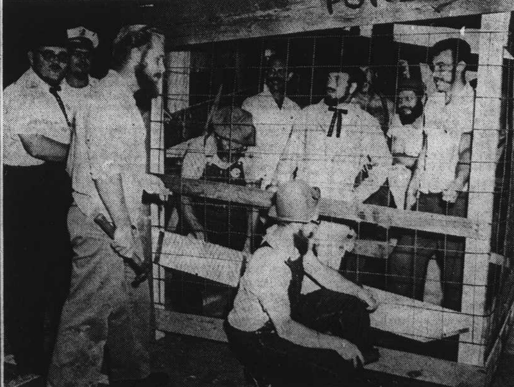
"THE BROTHERS OF THE BRUSH" recently showed the people of Brevard and Transylvania county that they meant business when they said that those persons not complying with centennial regulations were going to the "pokey". The brothers constructed "the hoosegow", pictur-

Brevard junior high school, —Turn to Page Seven