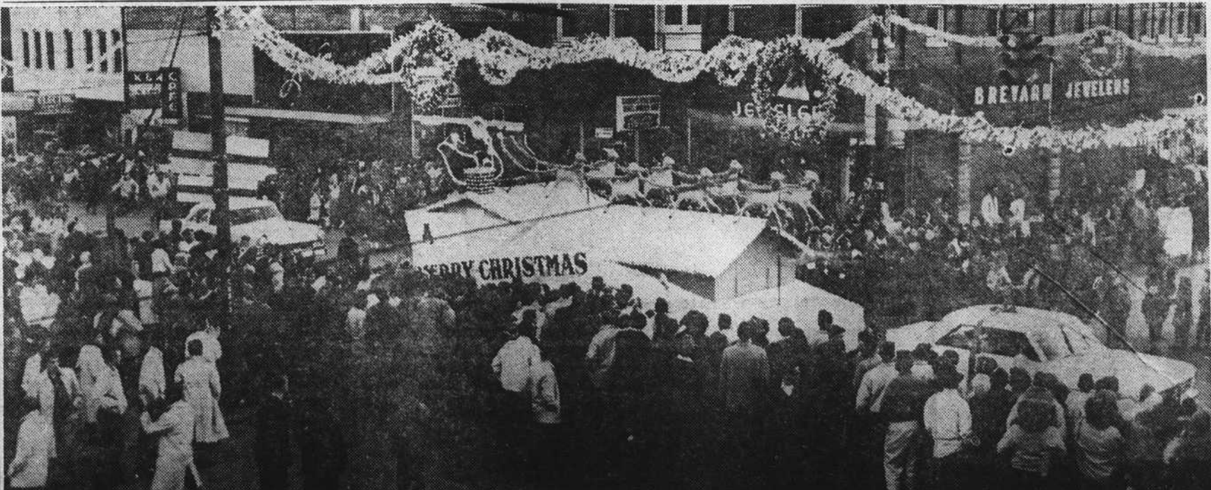
SANTA CLAUS came to town last Thursday afternoon, and his arrival marked the opening of the 1961 Christmas shopping season. He is pictured above riding atop the beautiful float be-

hind his reindeers as the gigantic parade crosses the square. An estimated crowd of 10,000 persons witnessed the event.