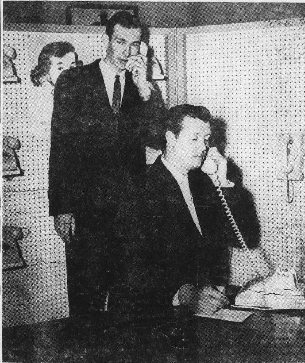
CITIZENS TELEPHONE COMPANY OFFICIALS are busy this week checking out the lines into the new switchboard, located in the modern building on East Main street. The company will cut-over to the new

The building on Probart street will be sold or leased when it is finally vacated.