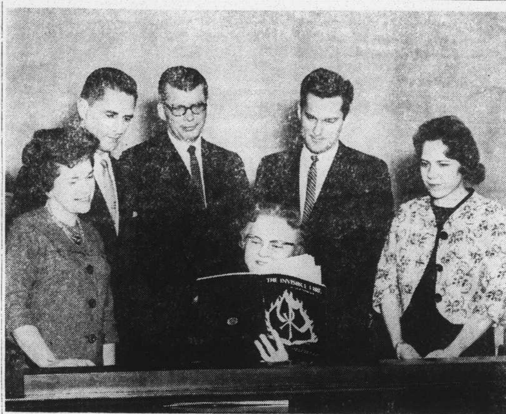
"THE INVISIBLE FIRE", a contemporary oratorio on the life of John Wesley, founder of Methodism, will be given by the Brevard Methodist church senior choir and the Brevard college choir on Sunday morning, March 18th, at the 11:00 o'clock worship service. Principal figures for the performance shown above, standing