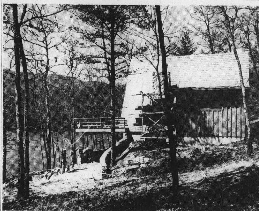
THIS LAKESIDE HOME is one of a number under construction on the shores of Lake Toxaway, in upper Transylvania. The lake, restored last year after an interval of nearly a half-century, is also the site of a new motor inn and golf course, both under construction.