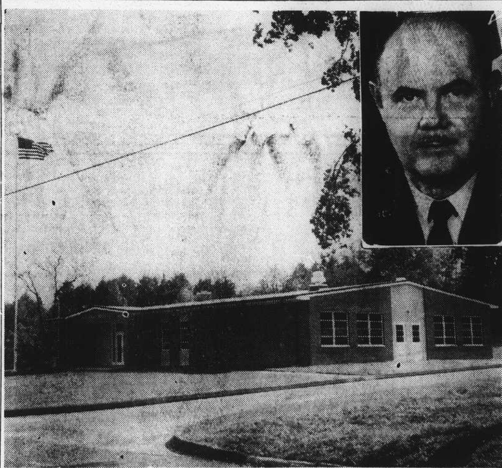
MILLER MEMORIAL ARMORY, above, will be the scene of Armed Forces Day ceremonies on Saturday afternoon, honoring two Brevard men who served in the nation's defense establishment. In the upper