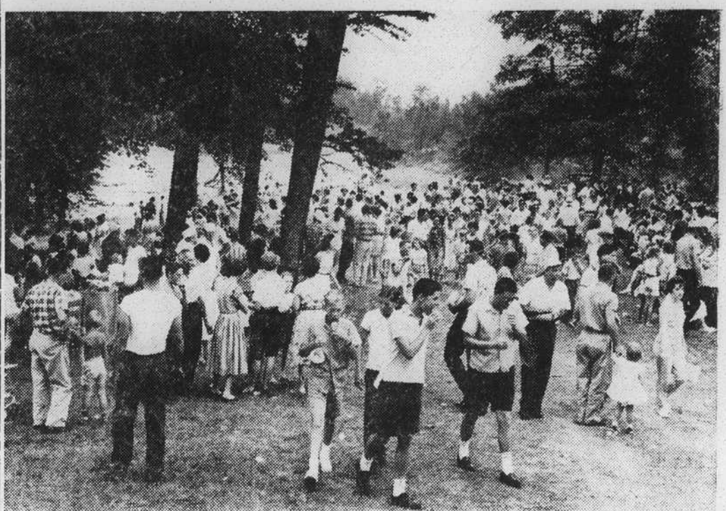
A TREMENDOUS CROWD, as the above picture would indicate, attended the annual Fourth of July picnic last Wednesday at Camp Straus. Some 5,000 persons were on hand for the many activities of the day, and the weather was ideal.