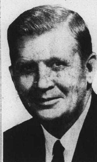
from Gov. Sanford, is by invitation only. Other affairs for the governor and guests include a picnic lunch Saturday, tea for wives Saturday afternoon, banquet Saturday evening. —Turn To Page Five