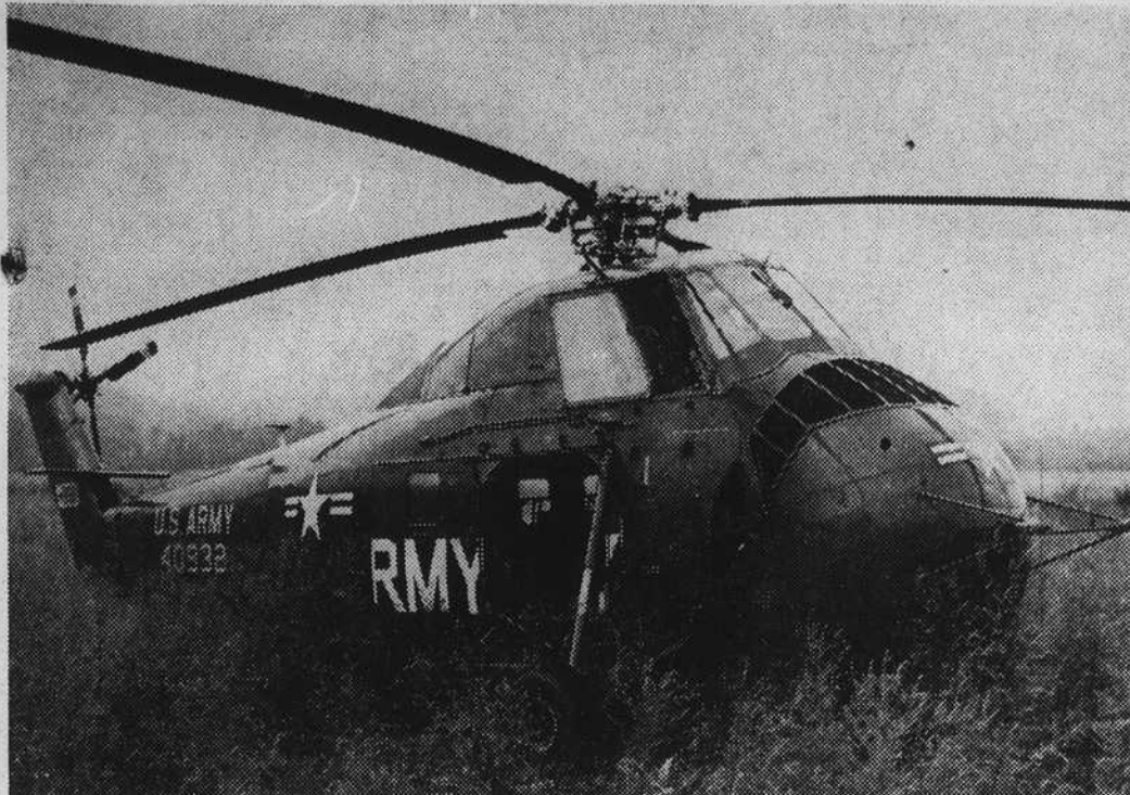
THREE ARMY HELICOPTERS were forced down because of the dense fog near Rosman last Thursday morning. Their successful landing was made in a field along U.S.

highway 64 across from the Almany Shell station. After several hours, they were able to resume their regular flight training schedule.