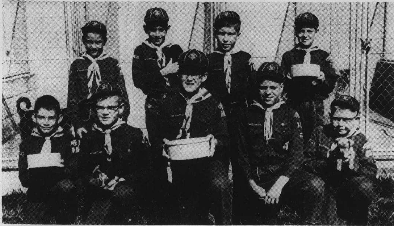
BREVARD CUB SCOUTS , Den 4, Pack 703, have adopted the animal shelter as their welfare project of the year. They also carried out the theme of "Be Kind To Animals" week by donating 5 feeding bowls to the animal shelter recently. The bowls were purchased by the Cubs from their regular