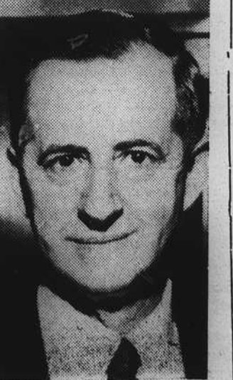
JUDGE GEORGE PATTON

Judge Patton will address the —Turn to Page Seven