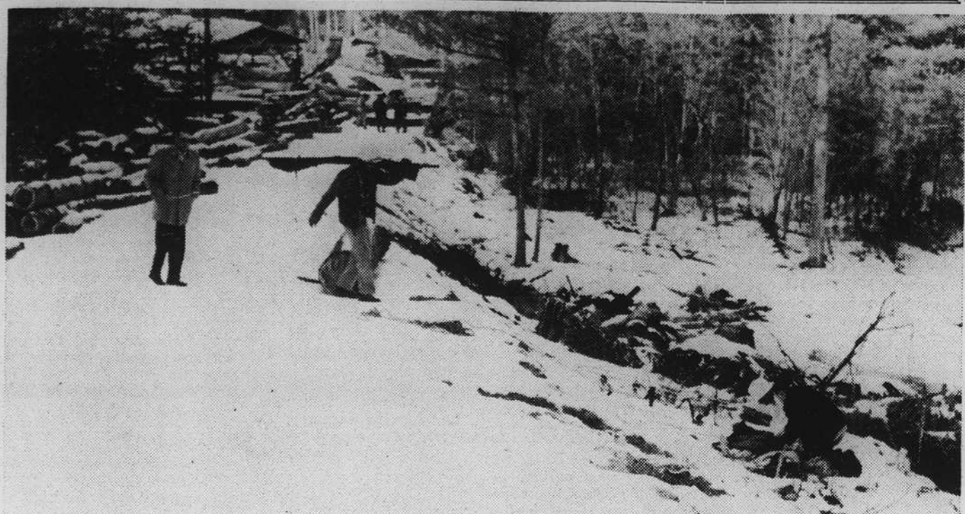
Sherwood Forest Monday afternoon. The lad suffered a broken leg, and the squad members had a difficult time bringing him up the icy and snow covered embankment and down the road to an ambu-