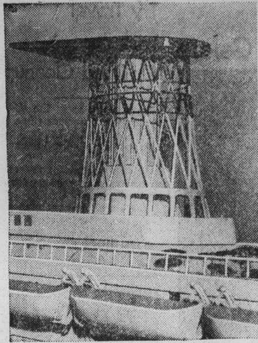
MODERN DESIGNERS LOOK UPWARD —A new concept in funnels is introduced by the Italian Line in Turin for the new 43,000-ton superliners Michelangelo and Raffaello. Both ships will have two stacks of the type shown at left, with a lattice outer shell over a thin pipe and a tilted aileron to carry away smoke.

The McLandress test of objectivity in statisticians is beautiful to behold. It consists of calculating, on the basis of the number of self-references in a speech, a co-efficient which is "the arithmetic mean or average of the intervals of time during which a subject's thoughts remain centered on some substantive phenomenon other than his own personality." According to the McLandress Co-Efficient, Professor J. K. Galbraith himself has a low rating of "one minute fifteen seconds." Richard Nixon's rating is a bit worse;