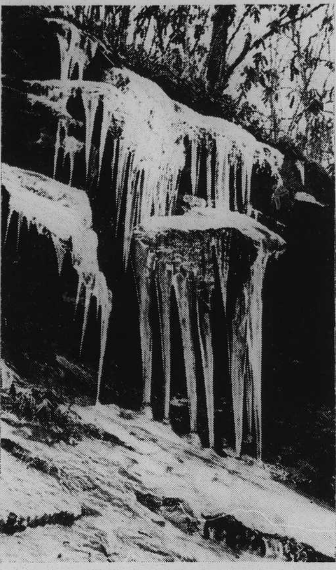
"IT'S FROSTY, MAN, FROSTY" along US Highway 64 in upper Transylvania county.