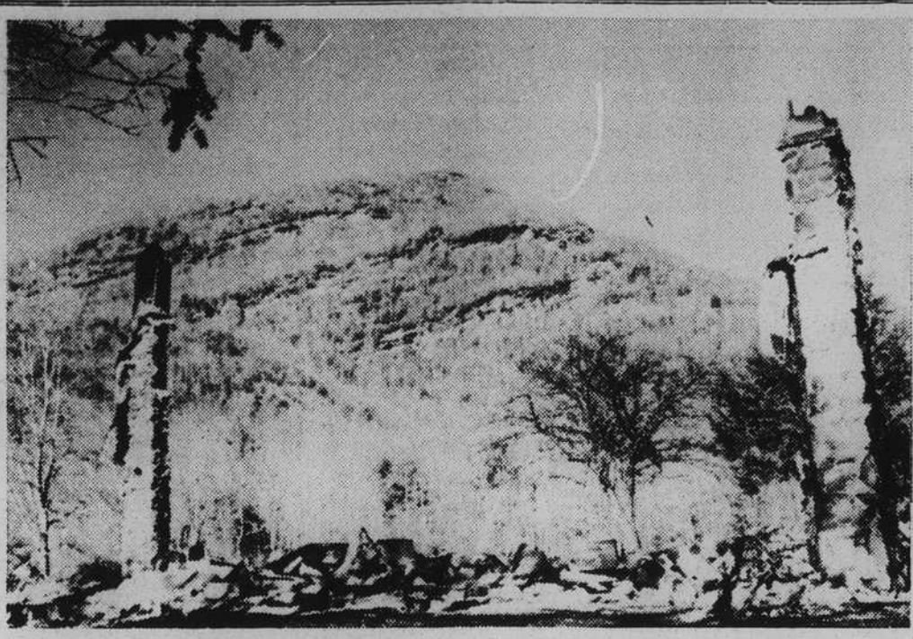
CHRISTMAS DAY DISASTER— The Clifford Reid home at Sapphire in upper Transylvania was destroyed by fire on Christmas day. A Times staff photographer snapped the ruins with the chimneys framing Mt. Toxaway in the background.