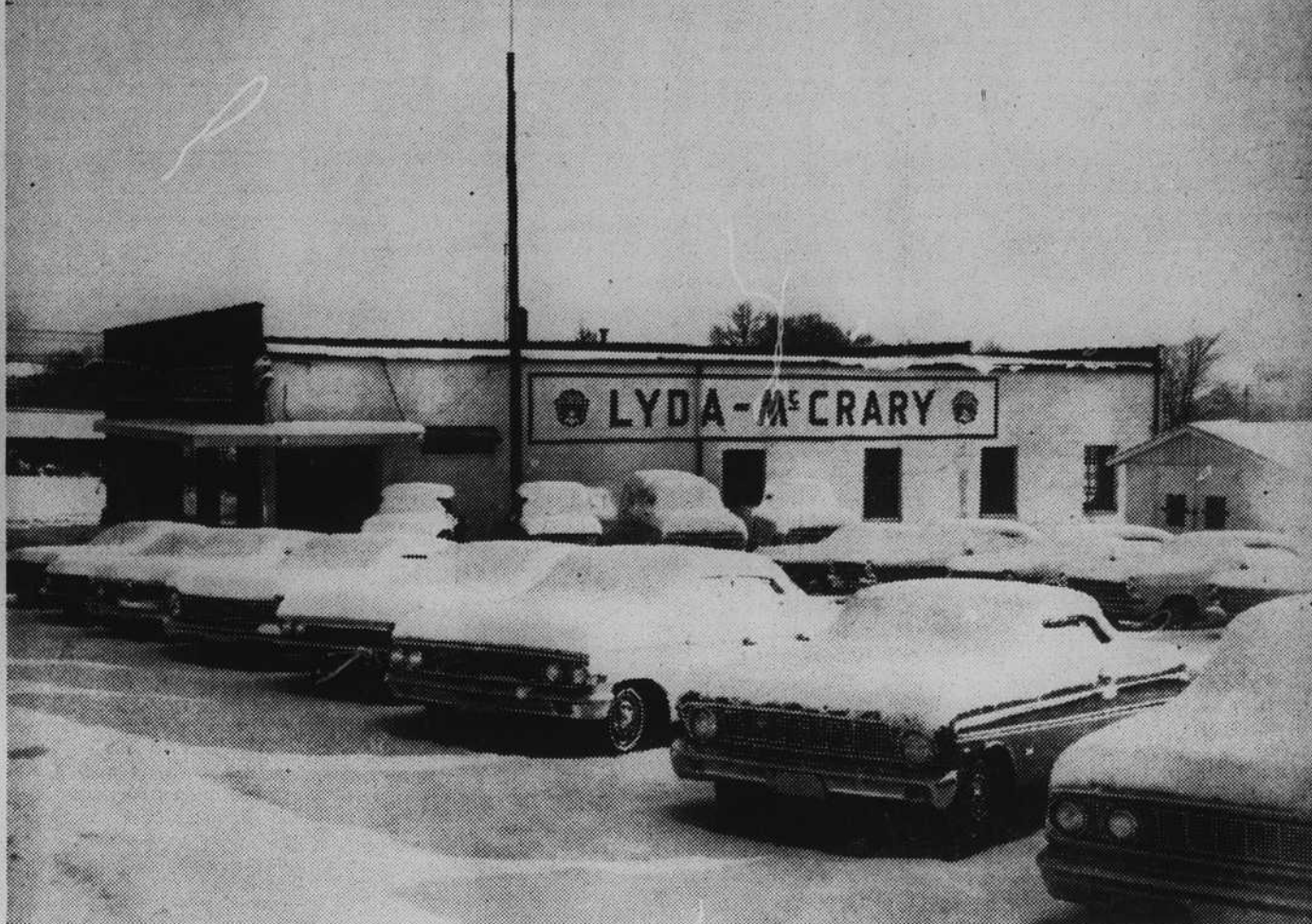
BELIEVE IN SIGNS? Ice, Ice, Ice, it says in the photograph at the left. And the signs were right, as 10 to 12 inches of snow fell